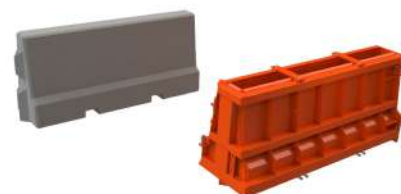
Road barrier mould