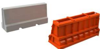
Road barrier mould - Connected