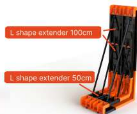
L shape extender 100cm