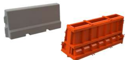
Road barrier mould